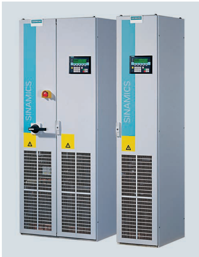
SINAMICS G150 drive converter cabinet units, versions A and C

With its SINAMICS G150 drive converter cabinet units, Siemens is offering a drive system on which all line-side and motor-side components as well as the Power Module are integrated extremely compactly into a specially designed cabinet enclosure. This approach minimizes the effort and expense required to configure and install them.